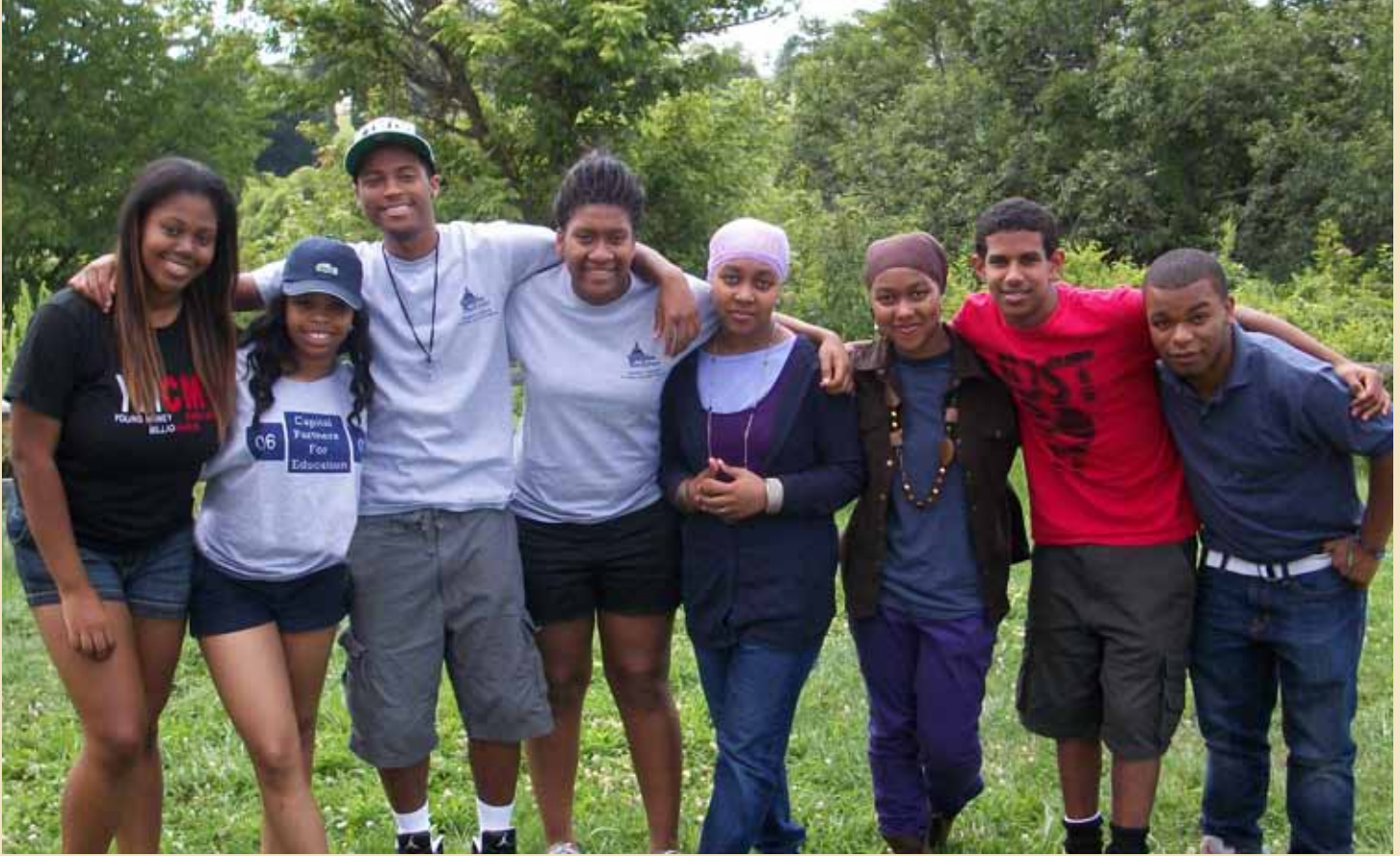
CPE Student Leaders