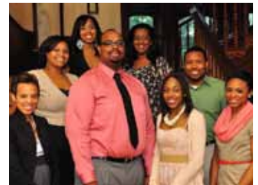
Good Life Investments Volunteers

This year we have 11 student leaders, all of whom applied for and were interviewed for the positions. We are proud of the leadership responsibilities these students are taking on and how inspirational they have been to their classmates.